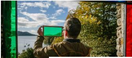
Using the coloured glass at Claife Claife Viewing Claife