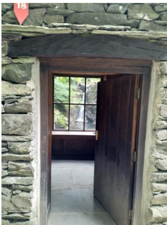
viewing hut interior of