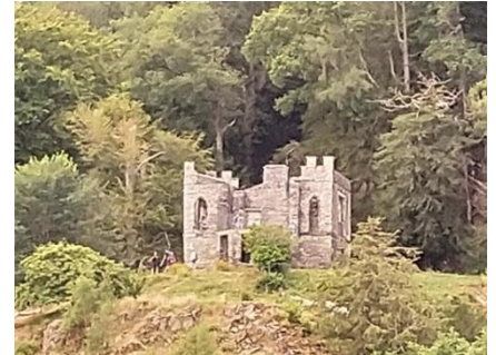
viewing Station, which

looks like a miniature castle on the edge of Windermere, was built in the 1790s and later expanded by the Victorians who put coloured glass in some of the windows.