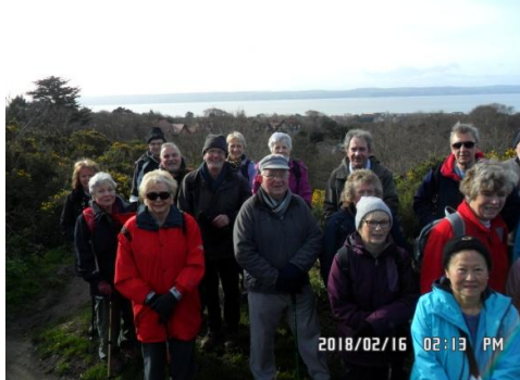
Taken from the top of Caldy Hill